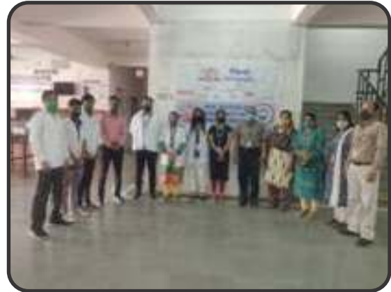
World Kidney Day celebration