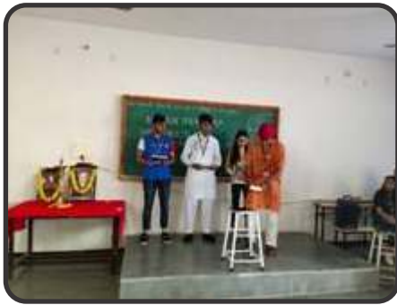
12th January 2021 NATIONAL YOUTH DAY