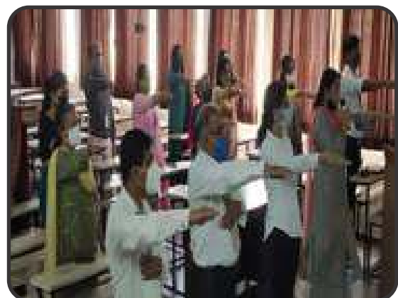
Hahnemanns Day OATH TAKING 10/04/21