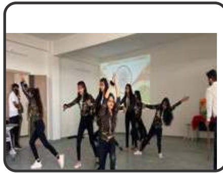
REPUBLIC DAY 26 TH JAN 2021