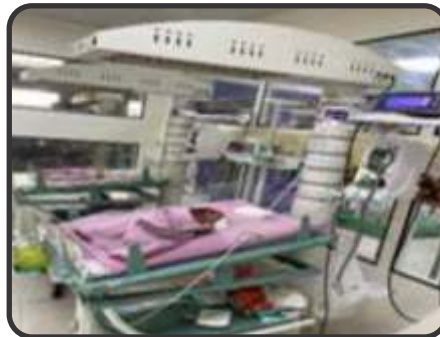
Visit of NICU- 3RD BHMS- Obstetrics & Gynecology-9/3/21