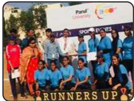
Runners up winner team in foot ball