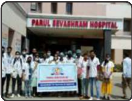
Visit of NICU- 4th BHMS- PRACTICE OF MEDICINE