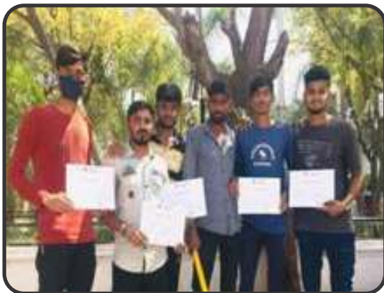
Winners of cricket team in Projection 21