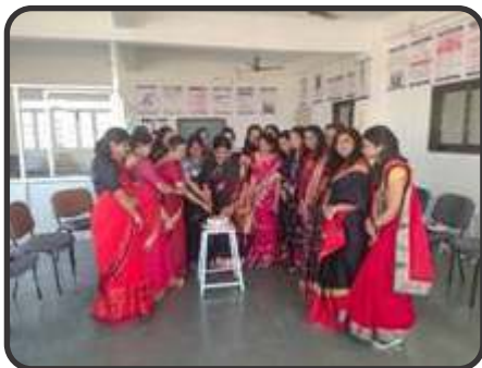
Women's day CELEBRATION 8/3/21