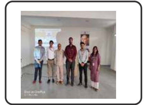
EDC Sensitization Campaign on healthcare innovation-3/2/21