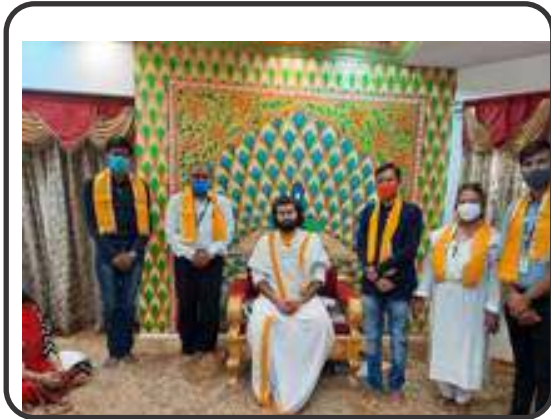
Camp on /world health day 7/4/21