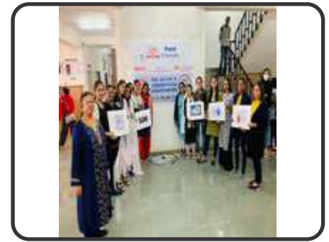
WORLD LEPROSY DAY 30 TH JAN 2021