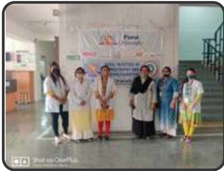
Sexual and Reproductive Health Awareness Day-12/2/21