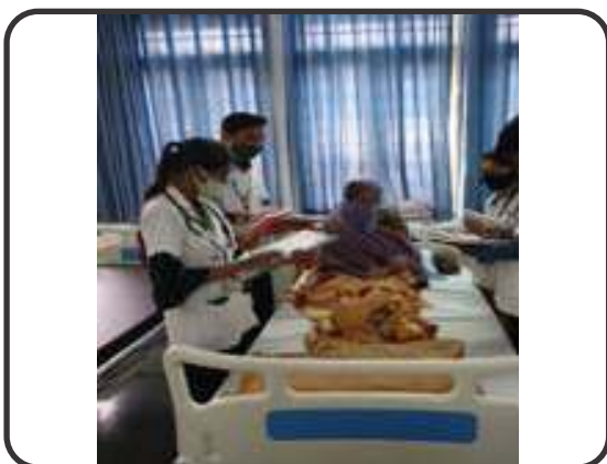
Case taking done by students in PIHRH college IPD