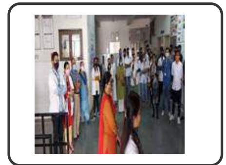
WORLD ORAL HEALTH DAY-20/3/21- COMMUNITY MEDICINE